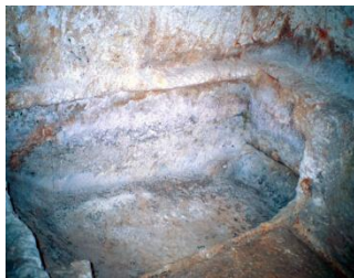
JESUS EMPTY TOMB